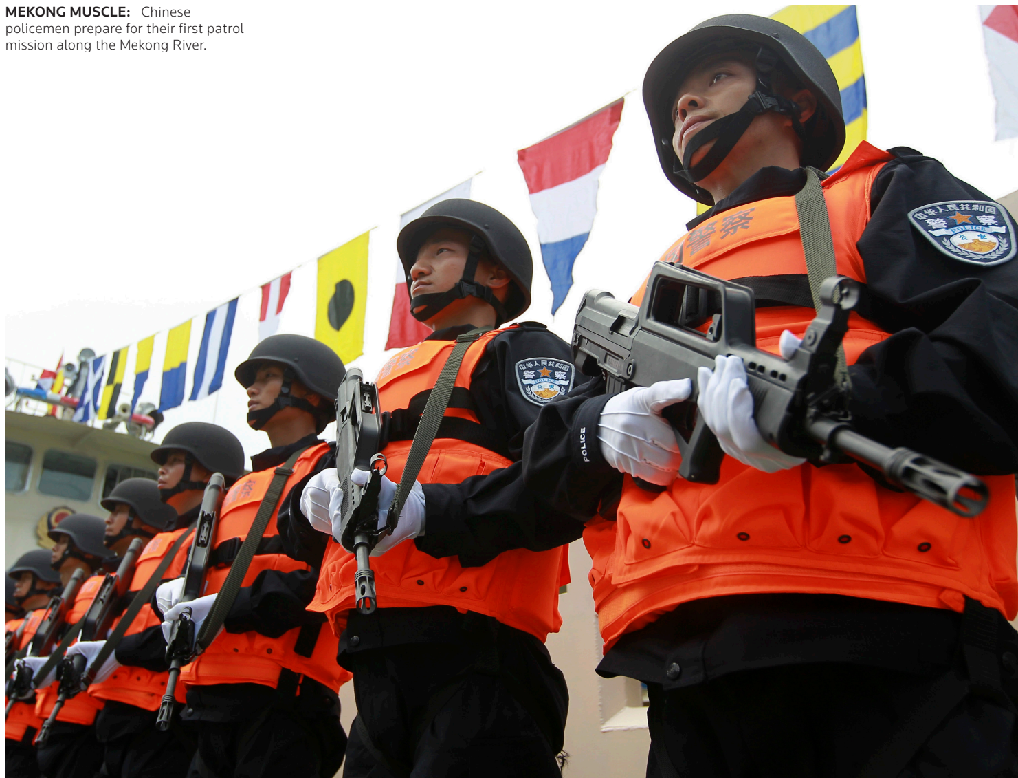
MEKONG MUSCLE: Chinese policemen prepare for their first patrol mission along the Mekong River.

For Pha Muang, it was just another incident in its self-declared 11-year-old mission