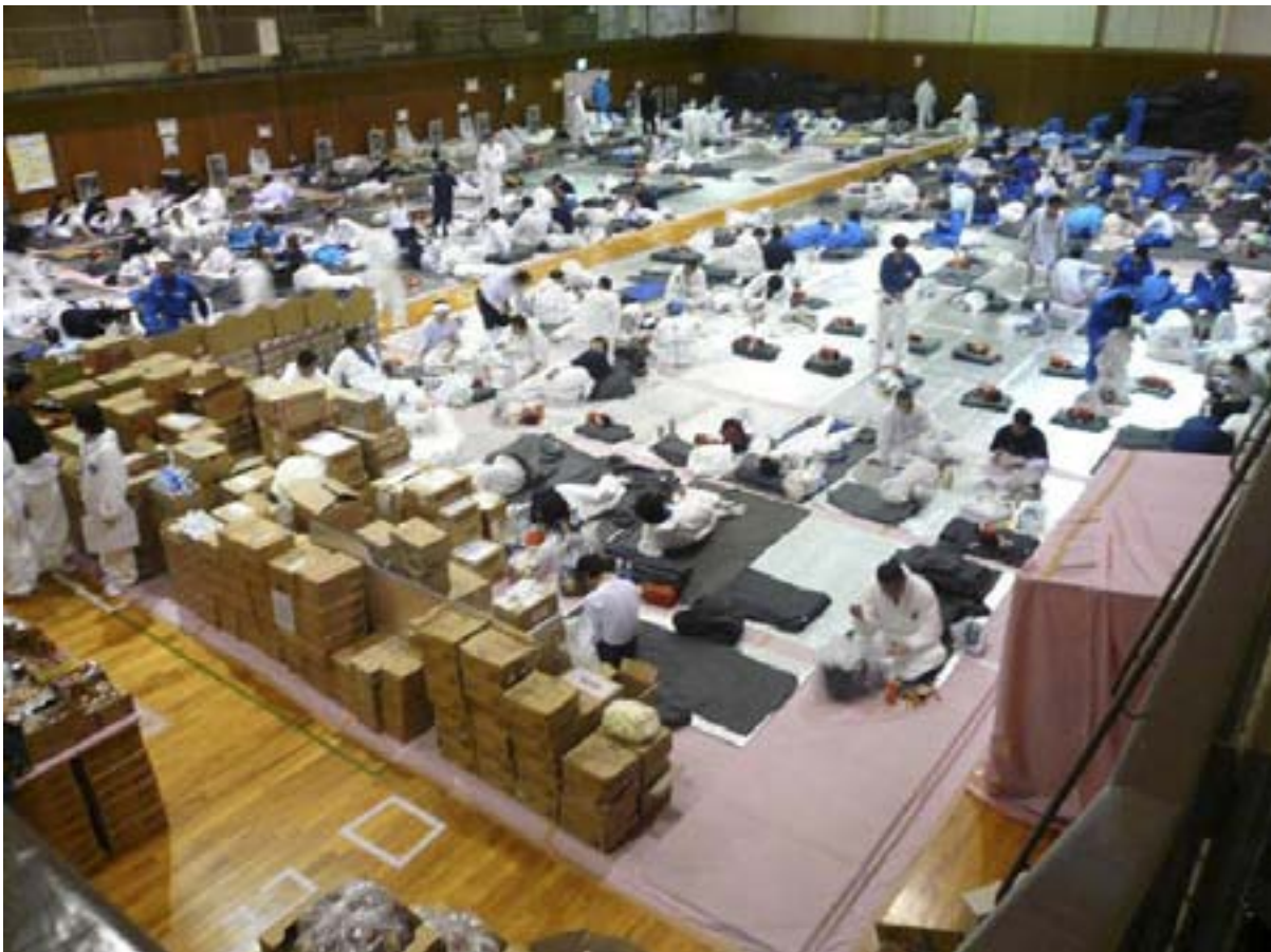
REST FROM A RISKY JOB: Workers engaged in operations to stabilize the crippled Fukushima Daiichi Nuclear Power plant take a rest on the floor of a gymnasium inside the grounds of the Fukushima Daini Nuclear Power Plant, about 10km away from the crippled Daiichi plant in Fukushima prefecture, northern Japan, in this photo taken May 7, 2011.

were brought in for the most dangerous jobs, a manager of the project said.