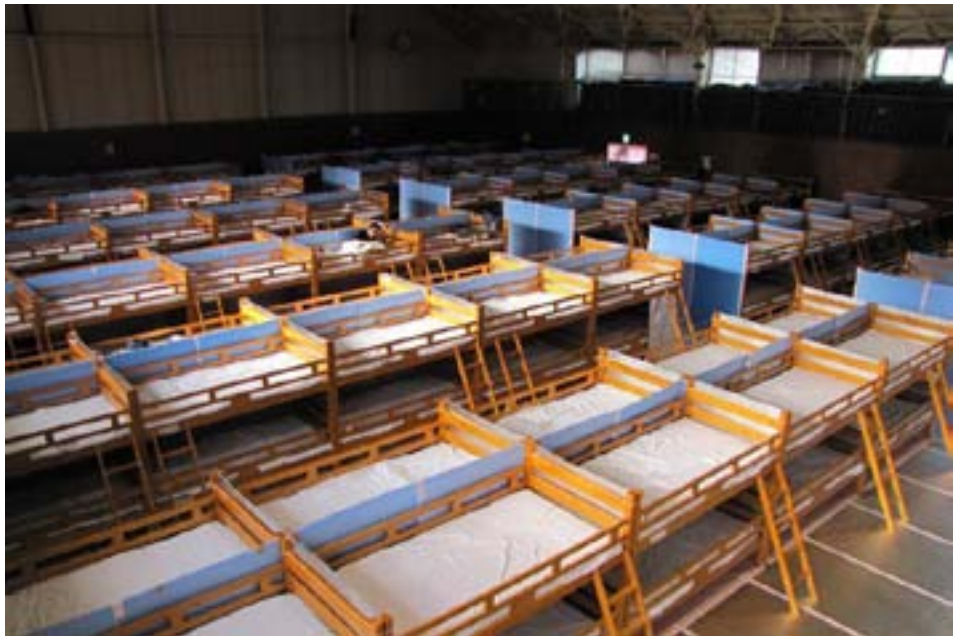
TEMPORARY QUARTERS: Bunk beds for workers are seen in a gymnastic hall at Tokyo Electric Power (TEPCO) Co.'s Fukushima Daiichi Nuclear Power Station in Fukushima prefecture, May 14, 2011.