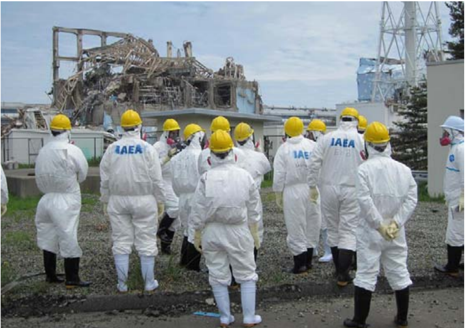
CRIPPLED PLANT: International Atomic Energy Agency (IAEA) inspection team members watch No.3 reactor at the crippled Tokyo Electric Power Co. Fukushima Daiichi nuclear power plant in Fukushima Prefecture, in this handout photo taken and released by TEPCO on May 27, 2011.

One hiring notice sought a truck driver for Miyagi, one of the prefectures hit hard by the tsunami. But when an Osaka day laborer in his 60s accepted the job, he was sent instead to Fukushima where he was put to work handling water to cool the No. 5 reactor.