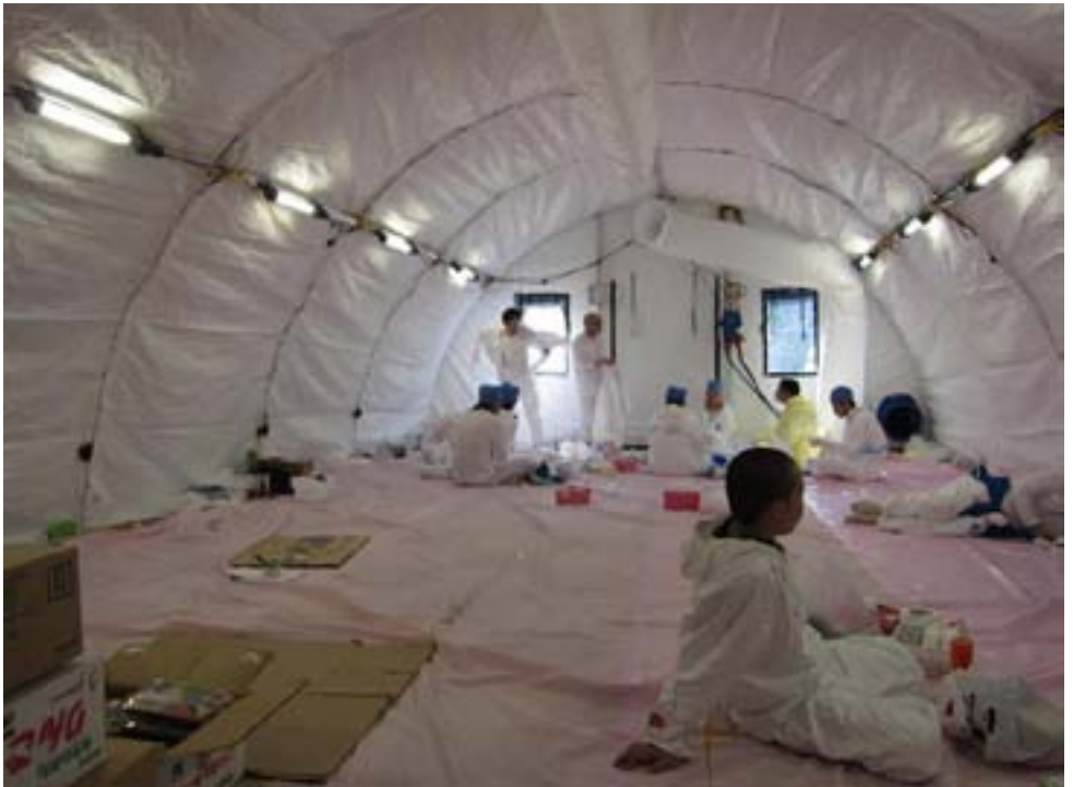
SHIFT WORK: Workers for Toshiba rest inside the Toshiba Rest Area at Tokyo Electric Power (TEPCO) Co.'s Fukushima Daiichi Nuclear Power Station in Fukushima prefecture, May 15, 2011.

The nearby Lawson's store has a sign on its bathroom door warning that anyone trying to flush a used syringe down the toilet will be prosecuted. Peddlers sell scavenged trash, including used shoes and rice cookers. A pair of yakuza enforcers in black shirts and jeans walks the street to collect loans.