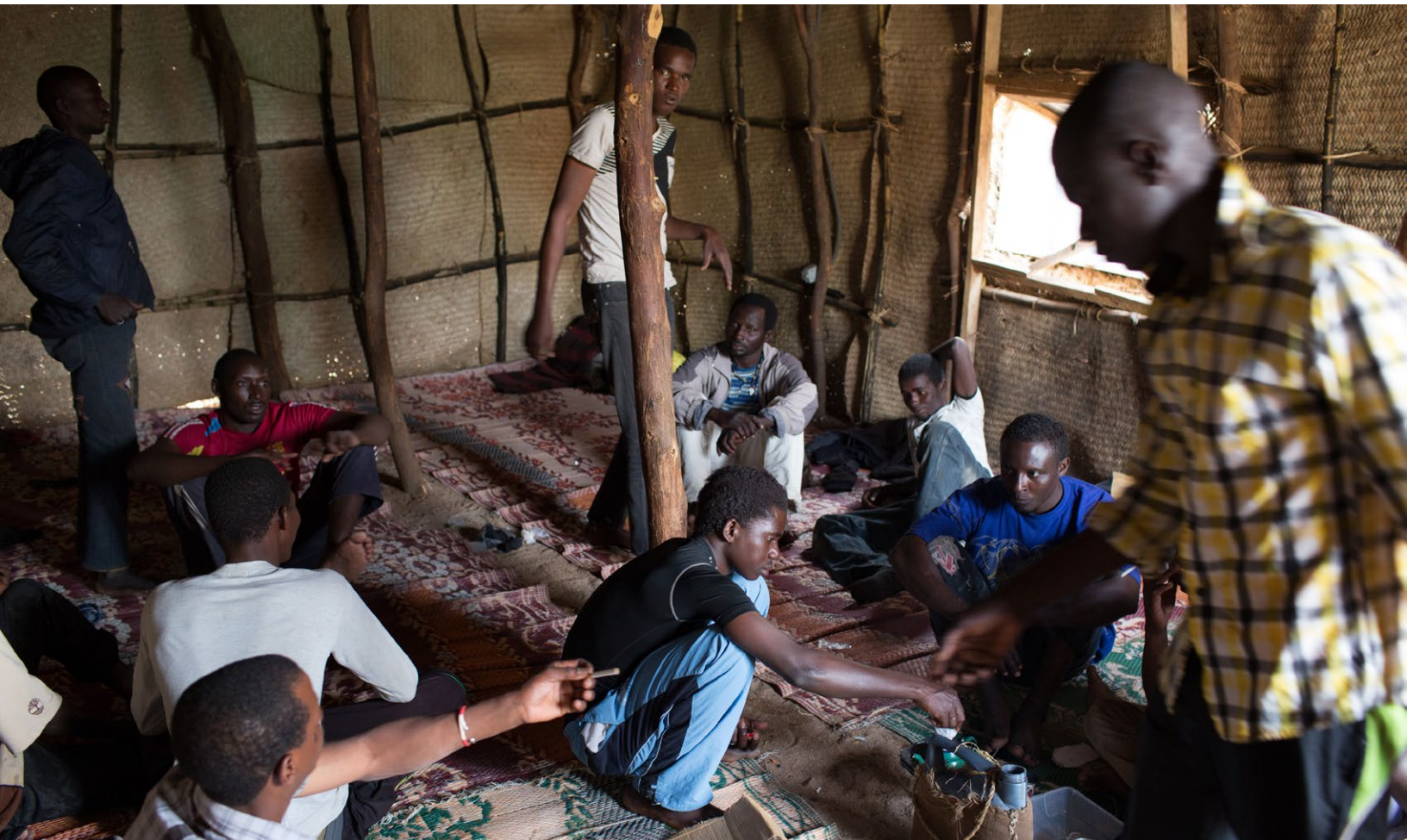
TRADE IMBALANCE: Senegalese and Guinean migrants (above) gather in a centre run by the Red Cross and the International Organisation for Migration (IOM) in Agadez, in March. Militia groups in southern Libya regularly deport migrants, but that does not stop others, such as those scrambling into a truck (below right), from heading north. Some would-be migrants leave messages on the walls of Agadez; these were written by Gambians.