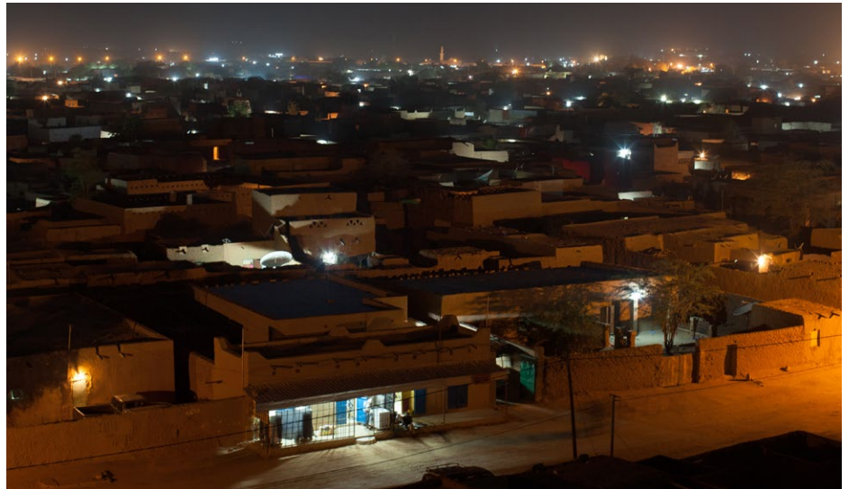
CROSSROADS: The northern Niger town of Agadez is a major staging post for migrants headed north, despite a government crackdown that followed the deaths of 92 migrants in the Sahara late last year.

“The level of tolerance of this issue in