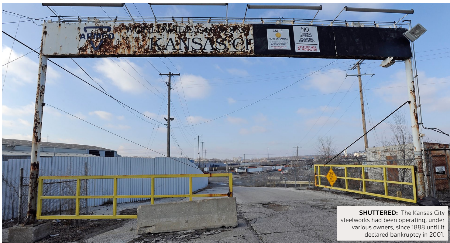
SHUTTERED: The Kansas City steelworks had been operating, under various owners, since 1888 until it declared bankruptcy in 2001.