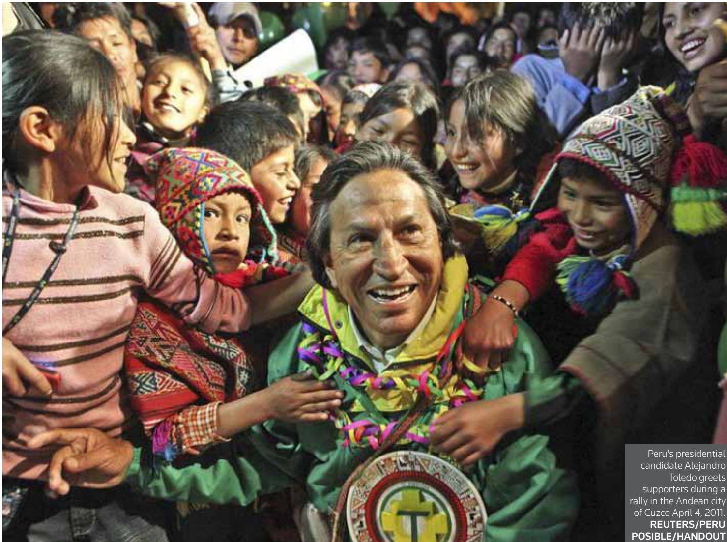
Peru's presidential candidate Alejandro Toledo greets supporters during a rally in the Andean city of Cuzco April 4, 2011.