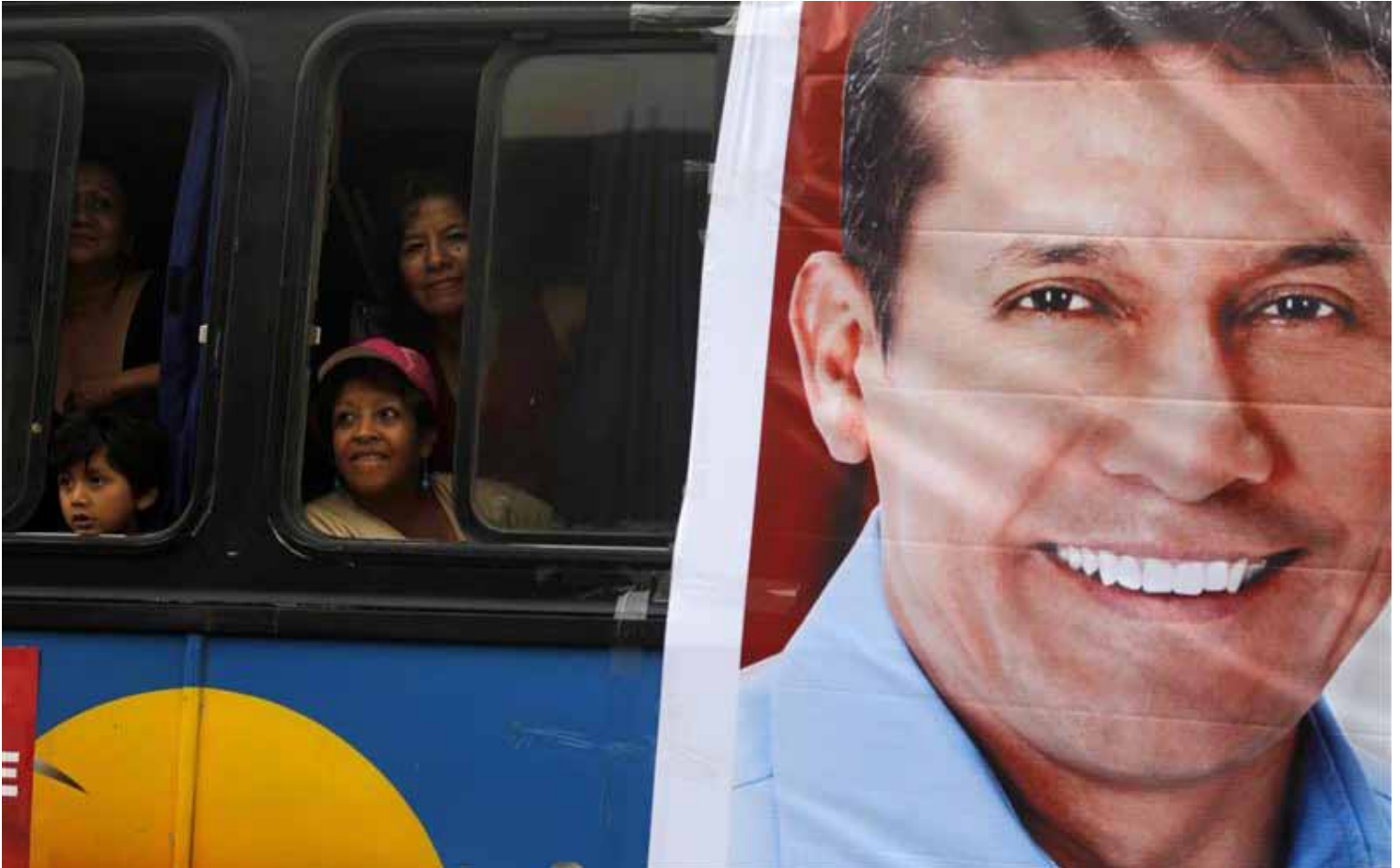
Supporters of Peru's presidential candidate Ollanta Humala watch a rally from a bus with a banner of Humala's photo in Lima April 1, 2011.

L EFTIST OLLANTA HUMALA leads the polls in Peru's April 10 presidential race and could face former president Alejandro Toledo, lawmaker Keiko Fujimori or former prime minister Pedro Pablo Kuczynski in a June 5 runoff.