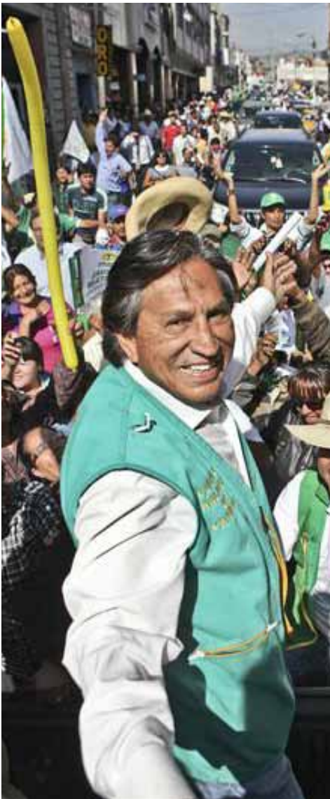
Peru's presidential candidate Alejandro Toledo greets supporters during a rally in the Andean city of Arequipa, April 4, 2011.

with a stable exchange rate. Fiscal deficit not to exceed 1 percent of GDP. Evaluate a gradual reduction of the national sales tax to 14 percent or 15 percent, down from 18 percent currently.