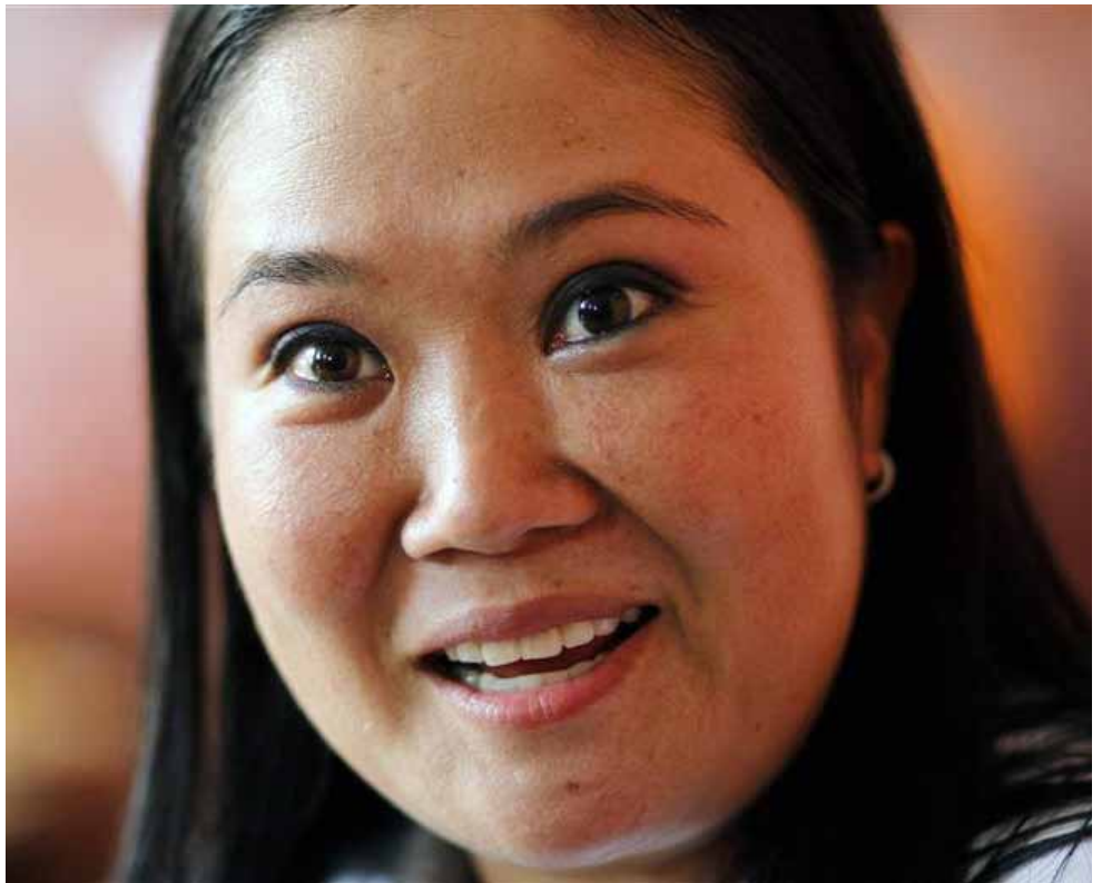
Peru's presidential candidate Keiko Fujimori talks to Reuters, as part of a Reuters Latin American Investment Summit interview, during a campaign rally in a shanty town in San Juan de Lurigancho, a district on the outskirts of Lima, March 29, 2011.