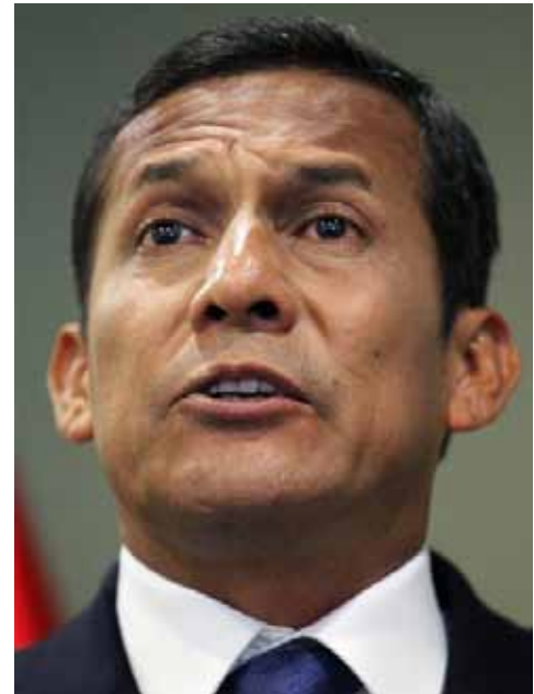
Peru's presidential candidate Ollanta Humala talks to the media during a conference in Lima, March 28, 2011.

Fujimori, 35, is shunned by many voters because her father, former President Alberto